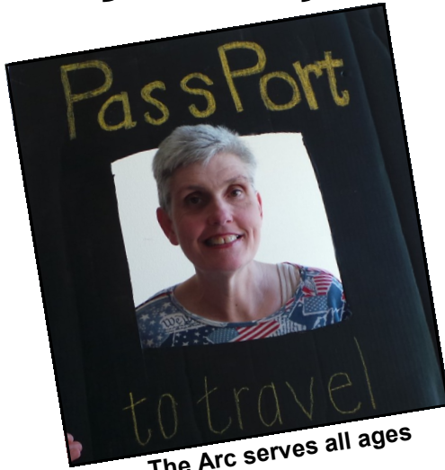
The Arc serves all ages