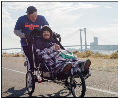
Inclusion for all abilities