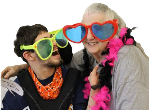
The Arc supports individuals with I/DD and their care providers.