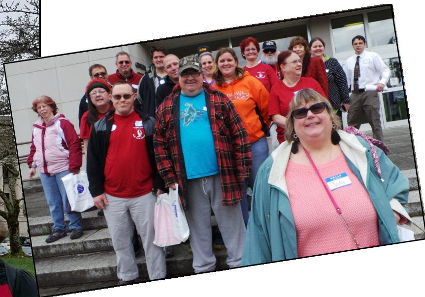
Above: Advocacy Day is a highly-anticipated yearly trip where self-advocates learn how to present their concerns to legislators which they do during a pizza lunch with their area lawmakers.