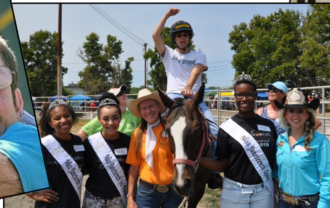
Partners N Pals Horseback Riding Day