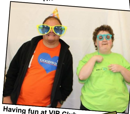
Having fun at VIP Club